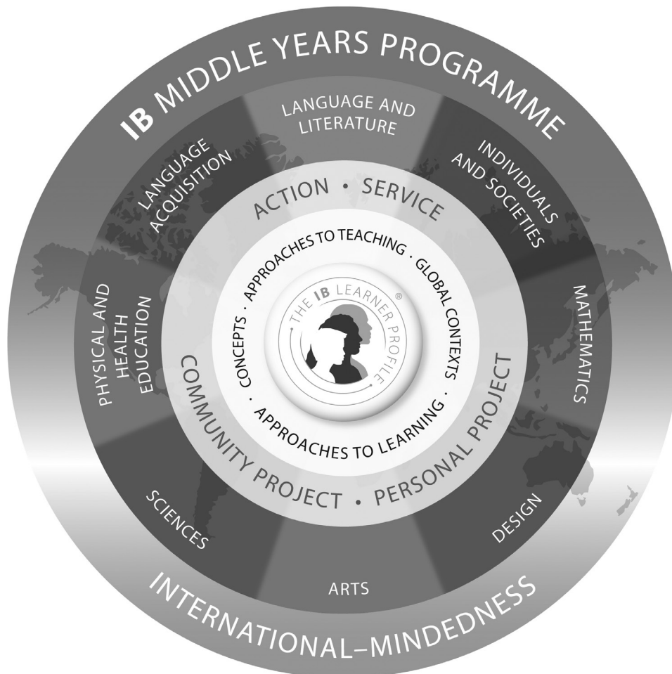
Figure 1 Middle Years Programme model

The MYP is designed for students aged 11 to 16. It provides a framework of learning that encourages students to become creative, critical and reflective thinkers. The MYP emphasizes intellectual challenge, encouraging students to make connections between their studies in traditional subjects and the real world. It fosters the development of skills for communication, intercultural understanding and global engagement—essential qualities for young people who are becoming global leaders.