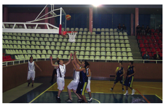
GKV High School Basketball Team defeated Gaziantep Anatolian High School 70-69 in an exciting game.