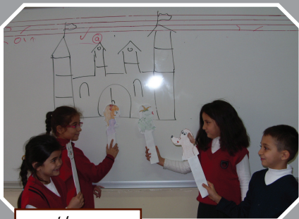
Here is a storytelling scene with second graders.

Everyone should have an experience like this. Don't miss these kinds of opportunities! I guarantee that you will learn new things while having fun at the same time.