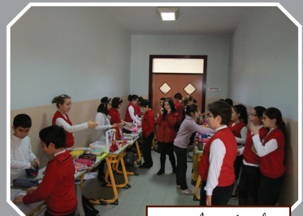
At school, the fifth-grade students are doing shopping at the stalls prepared by themselves.

We are proud to share these scenes which prove that the system works perfectly well.